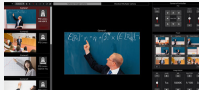
Works on Windows 7, Windows 8.1 & Windows 10