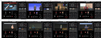
Works on Windows 7, Windows 8.1 & Windows 10